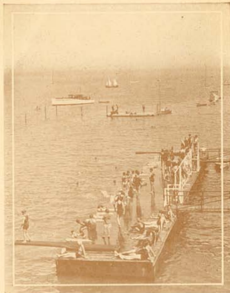
Take Your Dip in Bay or Ocean at San Diego

THE San Diego & Arizona Eastern Railway, completed December 1, 1919, and running from San Diego to El Centro, with Southern Pacific and its eastern connections forms a new trans-continental route between San Diego and the east. Through pullmans are operated eastbound and westbound on the Golden State Limited , premier train of Southern Pacific-Rock Island's