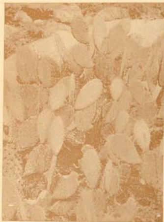
Prickly Pear (Opuntia Sp.)

TIJUANA —(16 miles from San Diego) Crossing of boundary to Old Mexico. Here are high class curio stores where souvenirs of old Mexico can be purchased at reasonable prices.