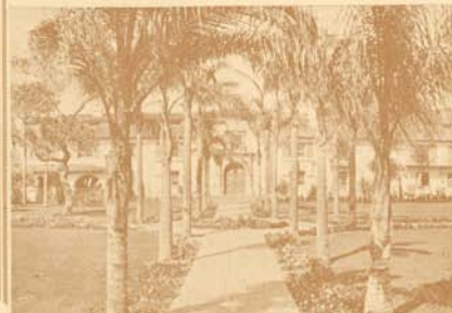
Center—The gallery watching Gene Sarazen win the $25,000 Inaugural Agua Caliente Open Golf Tournament Below—Palm-lined and flower-bordered walks on the grounds of the Agua Caliente Hotel