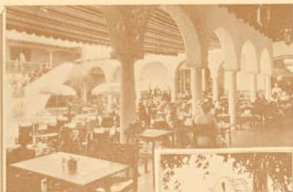
The Open-Air Patio Cafe in Agua Caliente's Delightful Casino, Agua Caliente, Mexico

For convenience of passengers arrangements have been made with both Mexican and American custom authorities to permit the checking of baggage through Mexico in exactly the same manner as between two