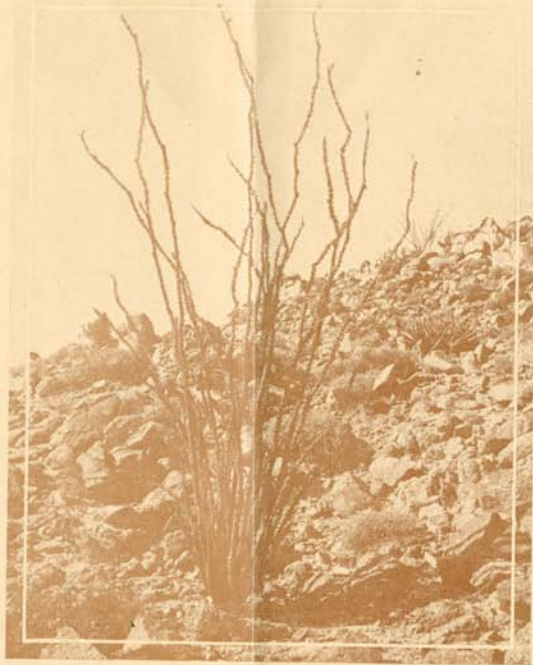
The Grotosque Ocotillo (Fouquieria Splendens)

to Coyote Wells is covered with many species of desert plants, including many varieties of cacti, some of which are illustrated in this folder. Many of these plants are in full bloom during the spring of the year, giving added color to the many hues of the hills and mountainsides. Geologists are greatly interested in the fossils found at the mouth of Carriso Gorge which include corals similar to those found in the Atlantic and not found among living Pacific Fauna , indicating that in the past this may have been the shore of the Atlantic.